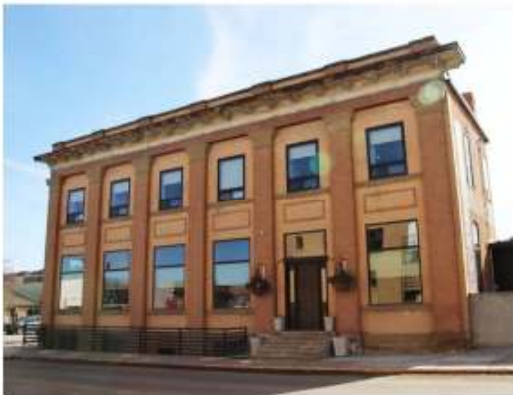
Most of the exterior of the building remains untouched.