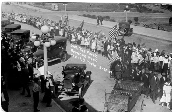
Off To The Front, WWI Parade, Roundup 1917