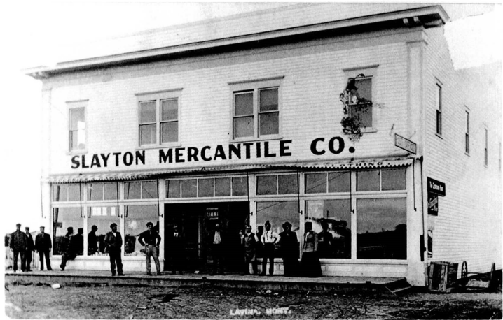
The first Slayton Mercantile Co., Lavina, MT 1908 (burned 1910)