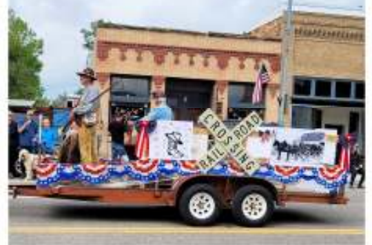
MVHM July RIDE float celebrating the museum's 50th birthday!