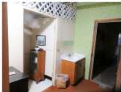
Before above and ... After below!