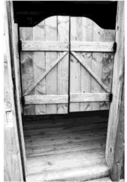
New Saloon Doors