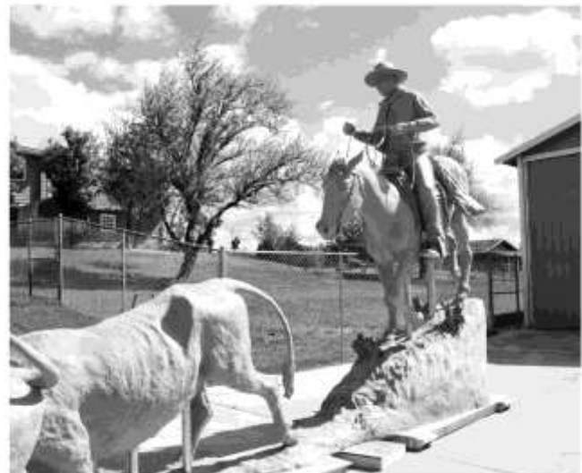
Clay model of the Teddy Blue Abbott Monument