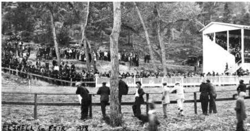
The Musselshell County Fair 1918