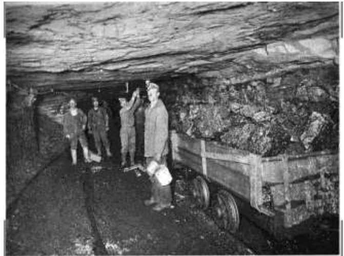
No. 3 Mine 1913

The first meetings to consider opening a museum in Roundup began on June 7, 1968. For the next few years a committee met in a variety of places including, The Odd Fellows Hall, the A & W dining room, the Montana Power Hospitality Room, the Pioneer Café banquet room, and at the Senior Center. On January 31, 1972, a motion was passed to purchase the old parochial school from St. Benedict's Catholic Church for $12,500, which included a $500 down payment.. The committee got to work on the lobby, the store, and the first display, the coal tunnel. They had the first viewing on July 1, 1972. But, the official opening of the museum was not until April 28, 1973. Stay tuned for next year's newsletter to have a more complete history of the museum for the 50th anniversary of the Musselshell